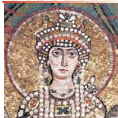
Empress Theodora 500–548

The most powerful woman in Byzantine history rose from deep poverty. Theodora’s father was a bear-keeper. Early in life, Theodora herself was an actress, a despised profession in Byzantium. But she caught Justinian’s eye, and in 525, they married.