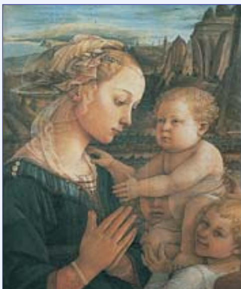
Madonna with Child and Angels (about 1463), Fra Filippo Lippi (Italy)

Christian religious art in the West strives to show the holy in realistic situations. Eastern Orthodox icons depict a spiritual world that is far removed from what some consider the "real" world. In Western art, the divine seems near and familiar. In the East, the divine looks far from our human level, but like windows, icons can help believers glimpse heaven.