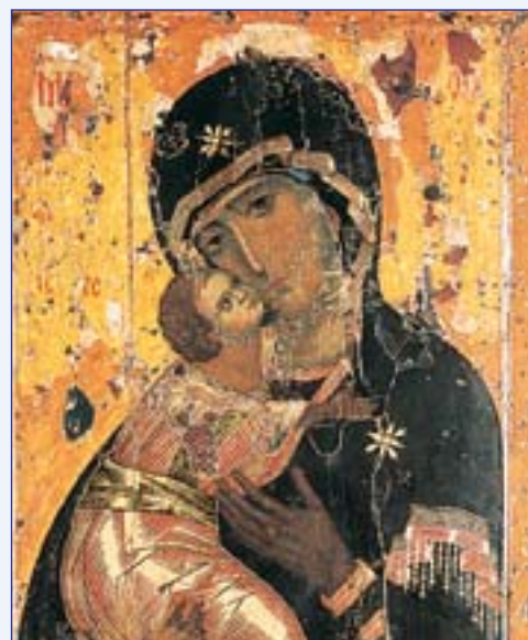
The Mother of God of Vladimir (12th century), icon commissioned by the grand duke of Kiev

Analyzing Go to a house of worship near you. See if and how the spiritual is portrayed there.