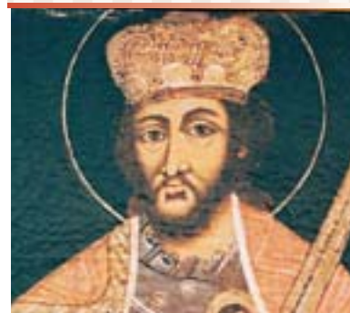
Alexander Nevsky 1220?–1263

Alexander of Novgorod was about 20 when he carved his name on Russian history. In 1240, the Swedes attacked the principality of Novgorod to stop its expansion. Alexander soundly defeated the invading Swedes at the Neva River. Grateful Russians called him Nevsky ("of the Neva") in honor of his victory.